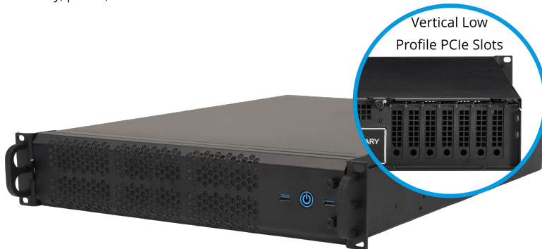
Vertical Low Profile PCIe Slots

Optimize your computing power with the 2U Plus Low Profile server case. Designed with a sleek 2U form factor, it offers unparalleled flexibility, boasting up to 7 PCIe x16 low-profile that allow seamless integration of your most powerful PCIe cards. Whether you're building for AI workloads, data analytics, or advanced simulations, this case delivers the space and scalability you need. Built for versatility, the 2U Plus supports up to 24 hot-swap SATA/SAS drives or 12 M.2/U.3 SSDs , providing exceptional storage options to suit any application. With a reliable redundant power supply , you can trust this system to deliver unwavering performance for critical tasks. Dual USB 3.0 ports on the front panel ensure easy peripheral connections, while its compact 425x557x88.8mm size and lightweight 13kg frame optimize rack space without sacrificing capabilities. Streamline your operations with 2U Plus—precision-engineered for professionals who demand reliability, power, and innovation.